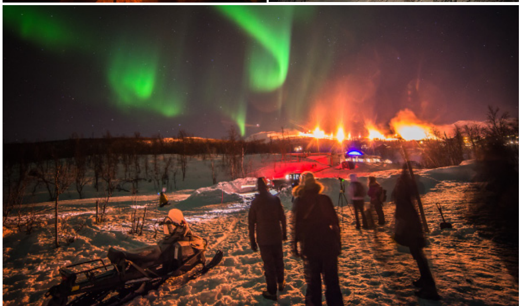
The Aurora Sky Point is situated just outside Basecamp Snowman (blue light) in Målselv Fjellandsby

BOOKING: +4777830570 booking@destinationsnowman.no www.destinationsnowman.no